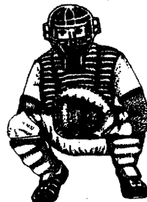
NOBODY ON BASE