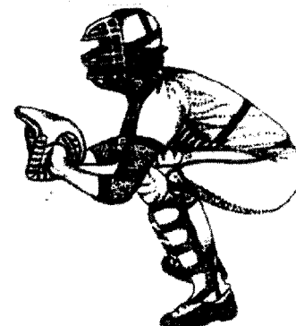
HEELS ON GROUND